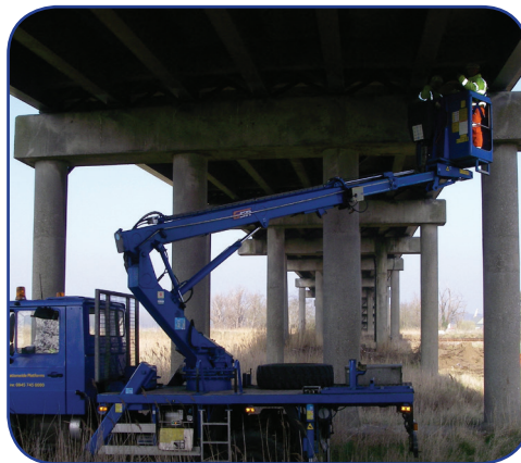
Simple, quick, effective and portable.